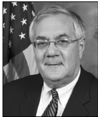
6. Barney Frank