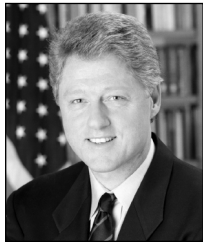
2. Bill Clinton