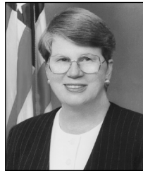
3. Janet Reno