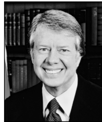
1. Jimmy Carter