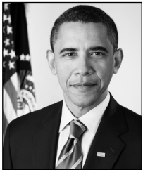
7. Barack Obama

1. Jimmy Carter pushed for and signed into law the Community Reinvestment Act which forced banks to lower their standards so that previously unqualified people could get a mortgage. 2. Bill Clinton then doubled-down on the Community Reinvestment Act and greatly lowered mortgage standards to allow a lot more unqualified borrowers to get loans. 3. Bill Clinton's Attorney General, Janet Reno, then intimidated banks with threats of legal action if they did not give loans to unqualified borrowers who would not have the income to pay the loans back. 4. A member of the Clinton administration, Franklin Raines